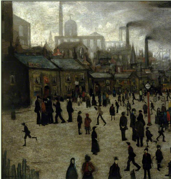
LS Lowry's A Manufacturing Town

Imagine a motto or slogan encapsulating the ambivalence of the human-machine relationship in the industrial age.